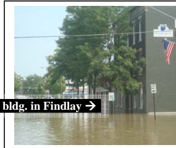
← Chamber's bldg. in Findlay →